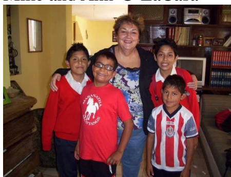
You can see that the children are well cared for and much loved